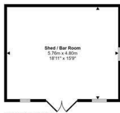
Shed / Bar Room Approx 28 sq m / 298 sq ft

This floorplan is only for illustrative purposes and is not to scale. Measurements of rooms, doors, windows, and any items are approximate and no responsibility is taken for any error, omission or mis-statement. Icons of items such as bathroom suites are representations only and may not look like the real items. Made with Made Snappy 360.